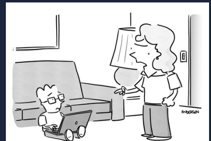
"Here's what you're going to do. You're going to give those 3 million people their credit card numbers back and you're going to say you're sorry."